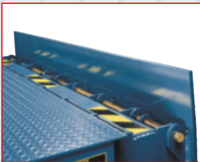
Available Safety Barrier Lip