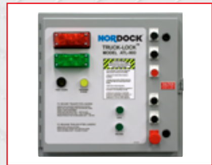
Optional Integrated Control Systems