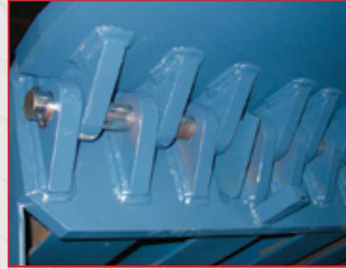
Exclusive Lip Lug & Header Plate Design

The front hinge rod is constructed with 75,000 PSI hard chrome plated shaft and the full width rear hinge rod is zinc plated and factory coated with anti-seize lubricant.