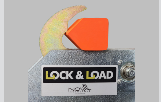
Designed to secure pentagonal RIG bars