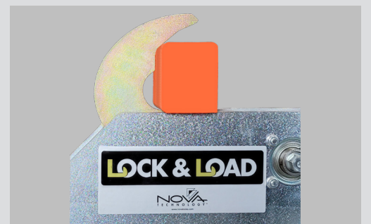
Secures standard trailers and any vehicle with an open RIG bar