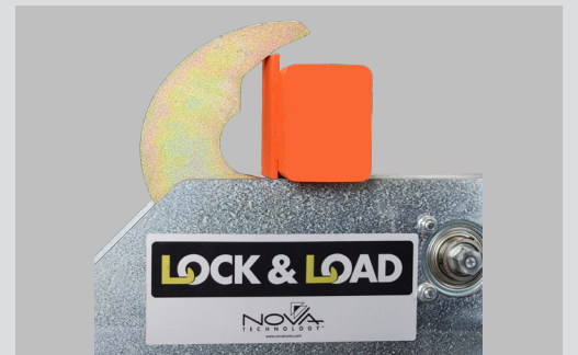
Engages reinforced RIG bars with 4 1/2-inch vertical center plates