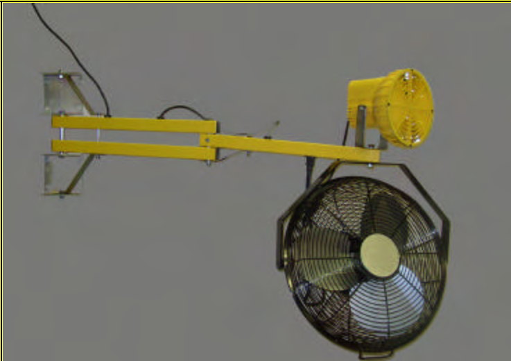
Shown with optional heavy duty mounting bracket and HPS lamp